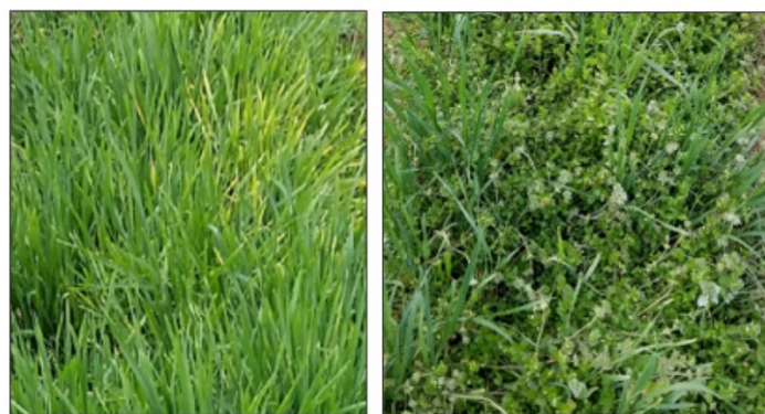
Figure 2. Thick winter wheat cover crop in a HT in Knoxville, TN (left) compared to a more weedy winter wheat cover crop in Lexington, KY (right), both in late winter.

Termination timing must also be balanced with weed management – primarily, the need to avoid adding weed seeds to the soil, but also being aware of weeds as potential hosts of pest insects and diseases. Weed suppression by cover crops can depend on multiple factors, including weed pressure, cover crop type, evenness and thickness of the cover crop stand, air temperature, and moisture. High tunnel trials in Tennessee found winter wheat (Fig. 2) to be very effective at smothering winter annual weeds but less so in Kentucky, where weed pressure was dominated by common chickweed. By irrigating the cover crops, weed growth was also increased and common chickweed produced seeds prior to cover crop termination. Therefore we inadvertently added weed seeds to the soil. This demonstrates an important point - you should always be aware of weeds growing in the cover crop and, if necessary, terminate the cover crop before these produce seed. If terminated prior to seed production, the cool-season weeds contribute to the total biomass. Chickweed samples were tested for nitrogen content and were 4% nitrogen, which is better than some covers in terms of scavenging ability!