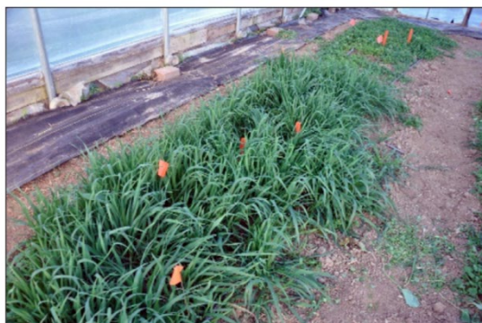
Figure 1. Oats in a high tunnel at the University of Kentucky Horticulture Research Farm.

For quick, early growth in the fall, select fast-establishing cool-season cover crops that generally do well in the open field in your location. Options include oats (Fig. 1) or other small grains including wheat and crimson clover. If your cash crop rotation includes brassica crops (kale, turnip greens, etc.), then avoid brassica cover crops such as mustards and canola.